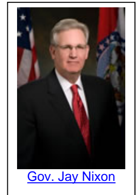
Gov. Jay Nixon

Health coverage is also a key component of the Quality Jobs Act, of which MASW was a key promoter when it was enacted several years ago. Gov. Nixon noted, “The Quality Jobs Act has incentivized business owners to create thousands of high-paying jobs that offer health care. Good middle-class jobs. The Quality Jobs Act has worked. We must not only continue this program, we must expand it.”